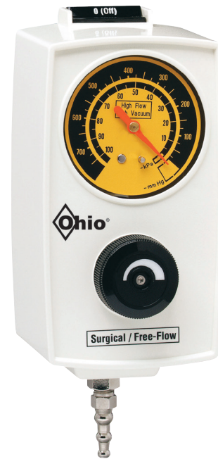
High Surgical/Free-Flow • 0-101.3 kPa gauge • 0-760 mm Hg gauge